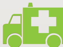
Communication Channel Apps